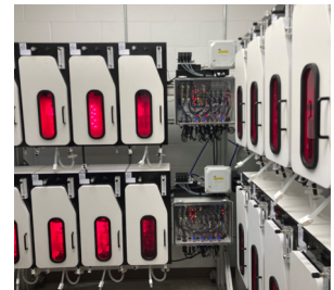
The new bioreactor equipment in the CARTI lab on Campbell River Campus.

The new bioreactor has been installed in the Seaweed Innovation Lab. The equipment will assist in investigating key questions about seaweed seed production. The project will support optimizing seaweed nursery parameters and innovating new methods of seed production to support the growth of the seaweed sector in British Columbia. Reach out to CARTI if you would like a tour!