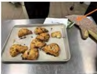
That's a $20

It was, to say the least, a gathering that reminded us all of the day-to-day interaction with colleagues that has been so missed and is such an integral part of the North Island College community.