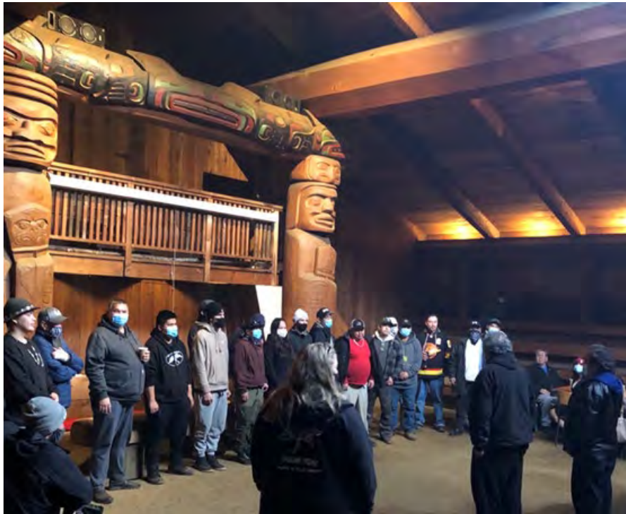
Opening Ceremony, Tribal Manager addressing HEO students Feb 28, 2022

This program is also funded through the Community Workforce Response Grant - Emerging Priorities.