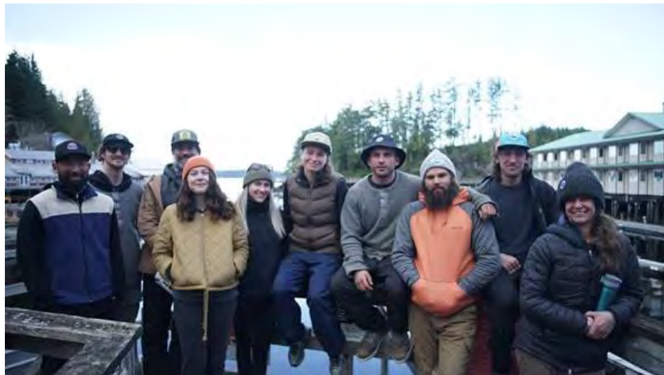
Kayak Guiding Foundations class March 2022