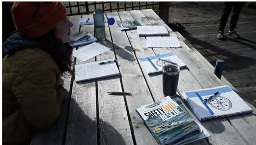
Outdoor classroom March 2022