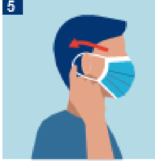
Place an ear loop around each ear or tie the top and bottom straps.