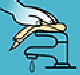
Use the towel to turn off the faucet.