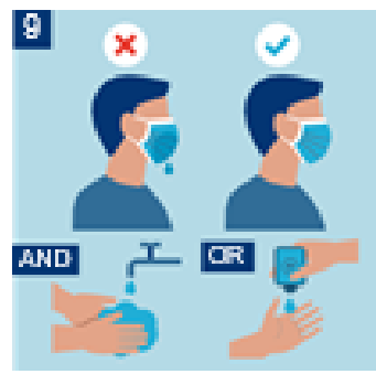
Replace the mask if it gets wet or dirty and wash your hands again after putting it on. Do not reuse the mask.