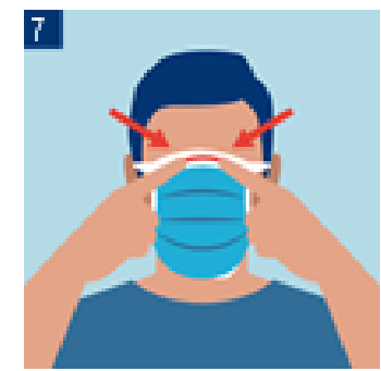
Press the metallic strip again to fit the shape of the nose. Perform hand hygiene.