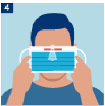
Locate the metallic strip. Place it over and mold it to the nose bridge.