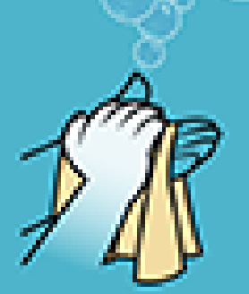
Dry hands with a single use towel.