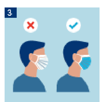
Ensure one side of the mask faces outwards.