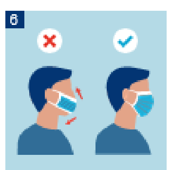
Cover mouth and nose fully, such by sure there are no gaps. Pull the bottom of the mask to fully open and fit under your chin.