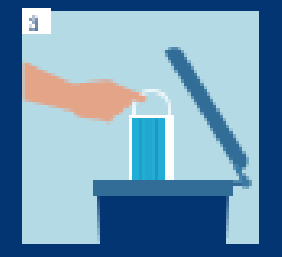
Discard the mask in a waste container.