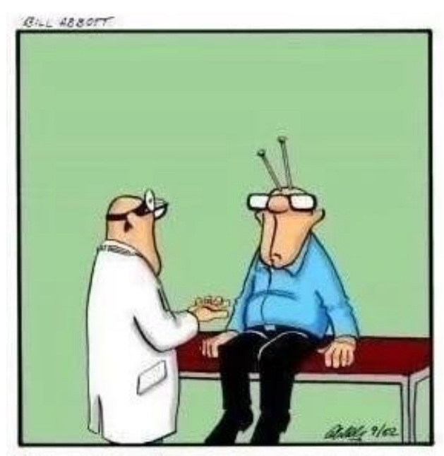
"And that's when you told her knitting is for old women?"